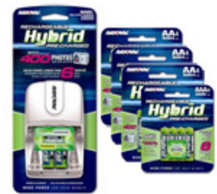
New generation rechargeable batteries