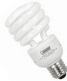
CFL bulbs in every shape

III These calculations will vary greatly depending on the climate your house is in. Heating changes will save more in colder climates and less in warmer climates. These are loosely based on a Washington DC climate.