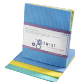
Reusable sponge cloths—each single sheet replaces 17 rolls of paper towels